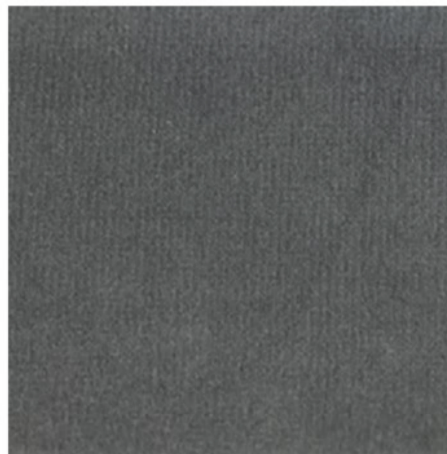
TEBQ019 Grigio scuro | Dark grey | Gris foncé | Dunkel grau | Gris oscuro | Тёмно-серый