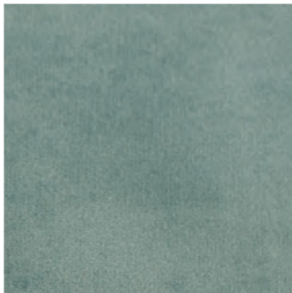
TEBQ015 Eucalipto | Eucalyptus | Eucalyptus | Eukalyptus | Eucalipto | Эвкалипт