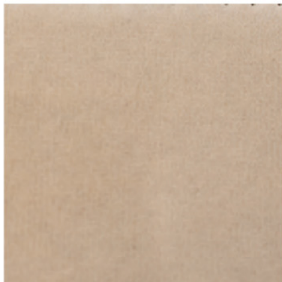
TEBQ002 Ecrù | Ecrù | Ecrù | Ecrü | Crudo | Экрю