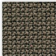
C 33 C