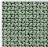
C 30 C