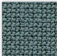
C 32 C