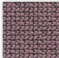
C 35 C