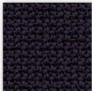
C 38 C