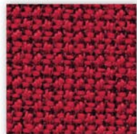
C 37 C