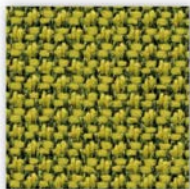
C 31 C