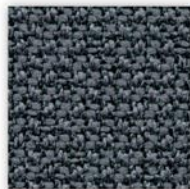
C 34 C